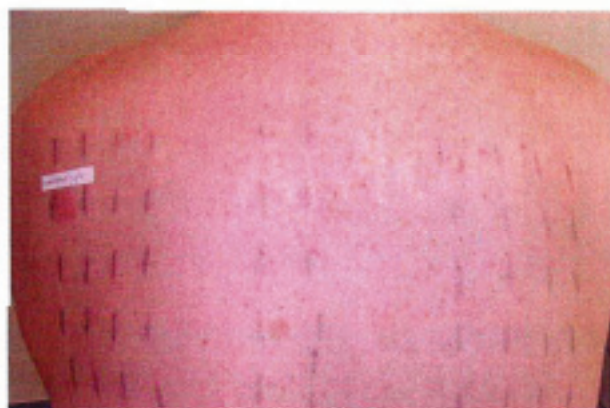
Fig. 2. Patch testing on fragile skin using Reskin® silicone dressing; no irritation, erythema or skin loosening were observed; there was a clear positive reaction to amcinonide (++) day 7).

to budesonide (0.01% pet.), a marker for corticosteroid allergy (Fig. 2). Six weeks later, the patient was additionally tested with a corticosteroid series (4), in order to investigate possible cross-reactions, again using Reskin to fix the chambers and with the patient wearing a tightly-fitting T-shirt. No technical problems were encountered, and the patient showed a (late) positive reaction to amcinonide only (++) at day 7) (Fig. 2). This is another acetamide that cross-reacts with budesonide. The relevance to the patient's dermatitis could not be established.